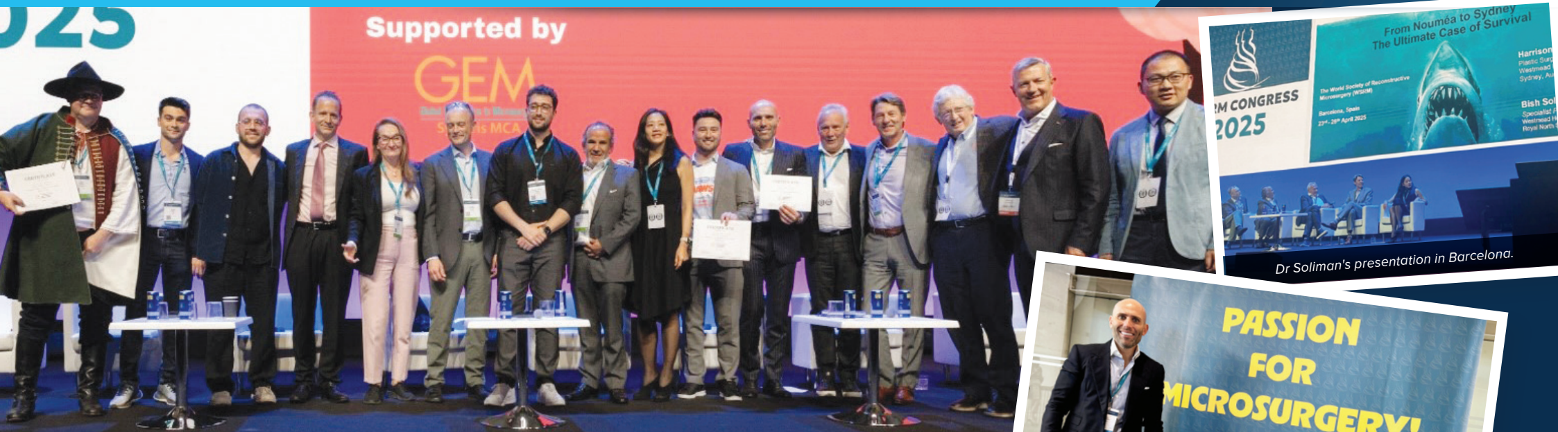
The winners and the judges of the Best Case, Best Save award at the Congress of the World Society of Reconstructive Microsurgery in Barcelona.