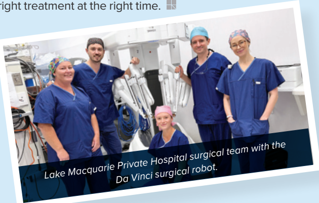
Lake Macquarie Private Hospital surgical team with the Da Vinci surgical robot.

By putting trusted data in the hands of clinicians and leaders, Ramsay is helping improve patient outcomes, streamline hospital care, and ensure people receive the right treatment at the right time.