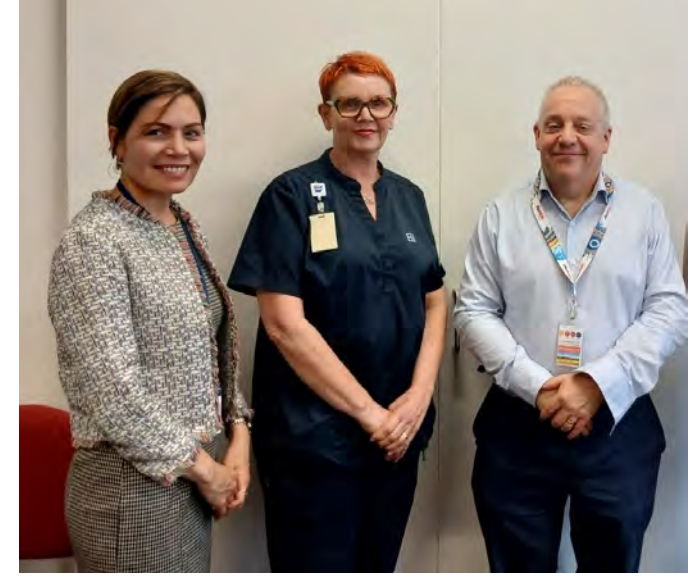
bevacizumab, with chemotherapy.

(cetuximab or bevacizumab), is often the best option.