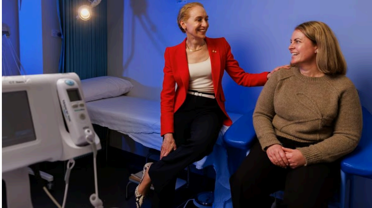
Photo credit: Max Mason-Hubers, The Australian. Photo featured in Melanoma Institute Australia news story