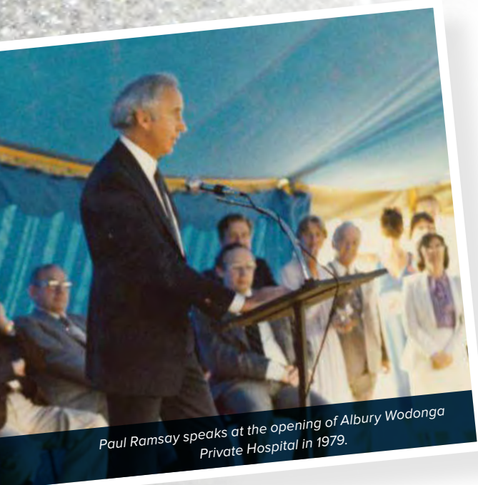
Paul Ramsay speaks at the opening of Albury Wodonga Private Hospital in 1979.