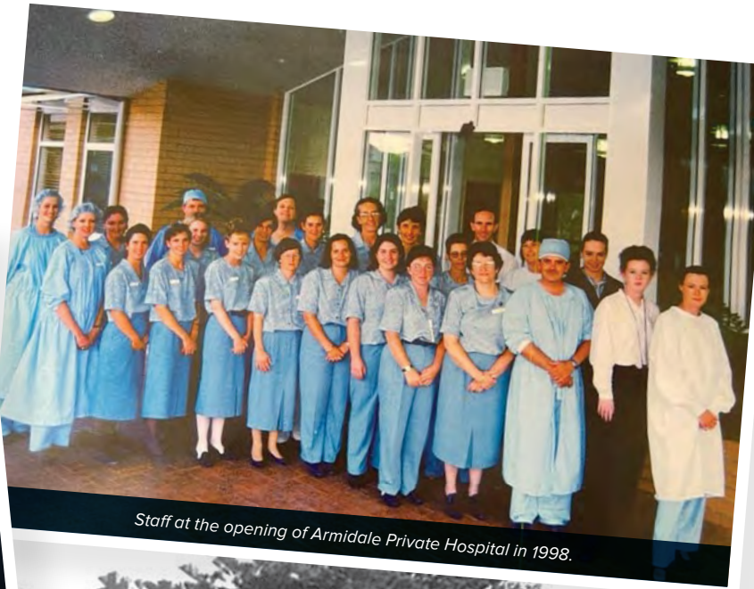
Staff at the opening of Armidale Private Hospital in 1998.