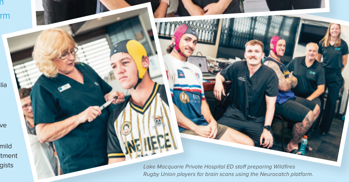
Lake Macquarie Private Hospital ED staff preparing Wildfires Rugby Union players for brain scans using the Neurocatch platform.