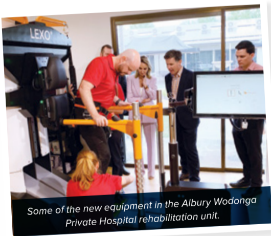
Some of the new equipment in the Albury Wodonga Private Hospital rehabilitation unit.

"I am extremely proud that now our patients can access rehabilitation services on site, to begin their recovery journey." ■■