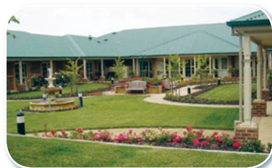
Top: Bairnsdale Private Nursing Home

Ramsay has secured and continues to apply for new licences in order to develop suitable facilities and where possible attract accommodation bonds.