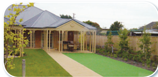
Above: Lakeview Aged Care Facility