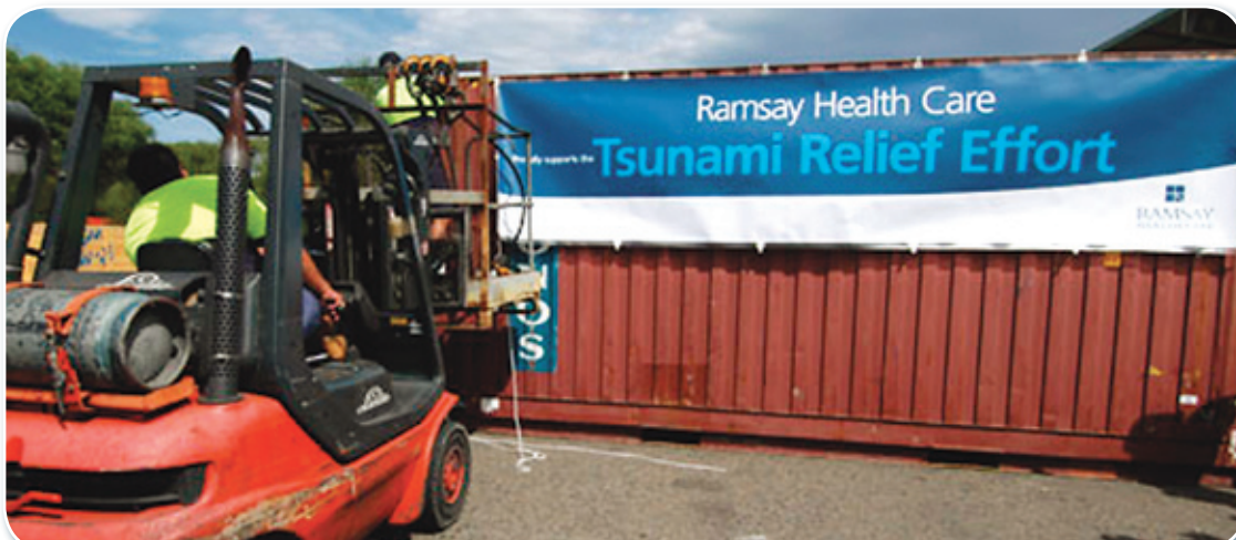
Above: The last shipment of the Ramsay Relief Package including food & medical supplies leaves for Sri Lanka in February.

Ramsay Health Care has agreed to offer salary packaging to all staff through Paradigm Total Salary Management. Trials will be conducted for 3 months in two selected Ramsay Health Care Hospitals and, if successful, the offer will be extended across all facilities in the later half of 2005. Find out more on page 5.