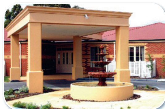
Far right: Sale Aged Care Facility