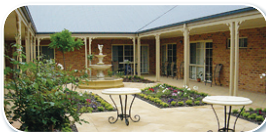
Right: Paynesville Private Nursing Home