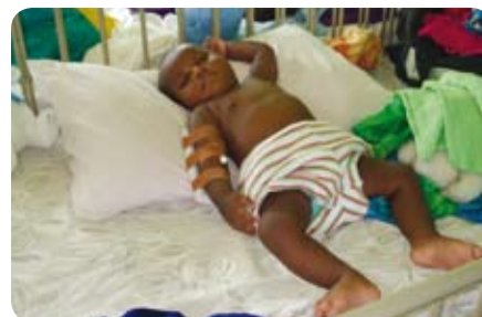
Left & Below: Port Vila Central Hospital in Vanuatu thanked Figtree Private Hospital staff for their generous donations to the children's ward.