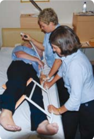
Above: North Shore Private Hospital Champion Training Workshop