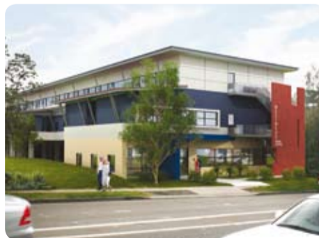
Above: Architects impression of the new extension to Westmead Private Hospital

A multimillion dollar redevelopment of Westmead Private Hospital including a new maternity wing and cancer unit has been announced by Ramsay Health Care with construction set to begin later this year.