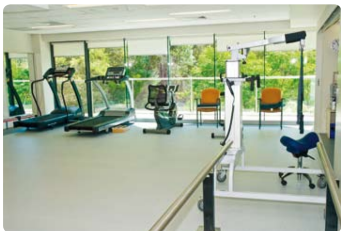
Above: The new rehabilitation centre at John Flynn.

Both patients currently hospitalised or living in the community may benefit from one of the many programs available and can thus be referred.